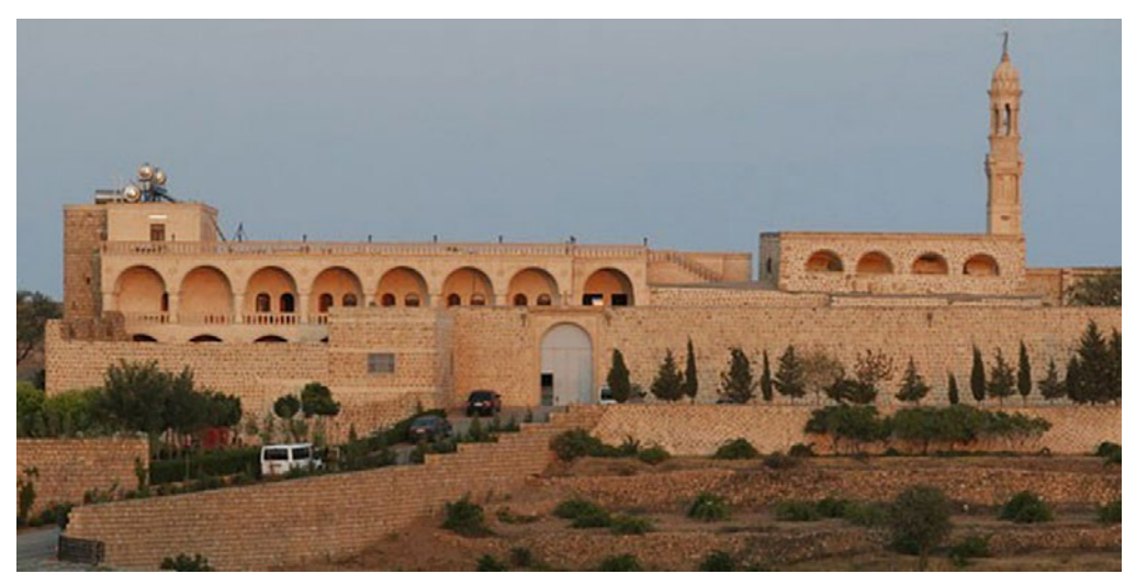
Mor Gabriel Monastery, Mardin

Legislative changes should be made in order to ensure the return of the immovable property which has been seized through expropriation or any other way, from all belief groups.